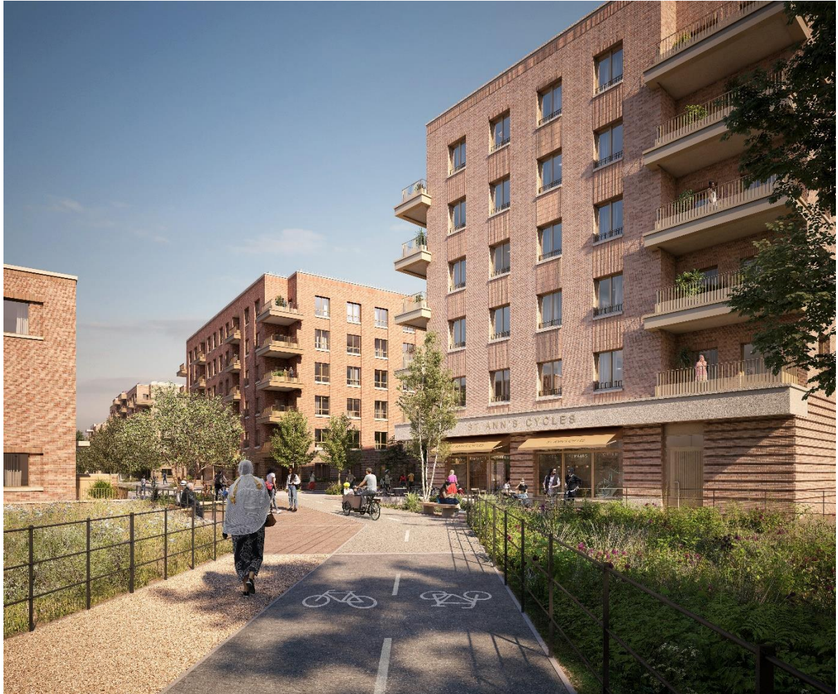
Corner retail unit