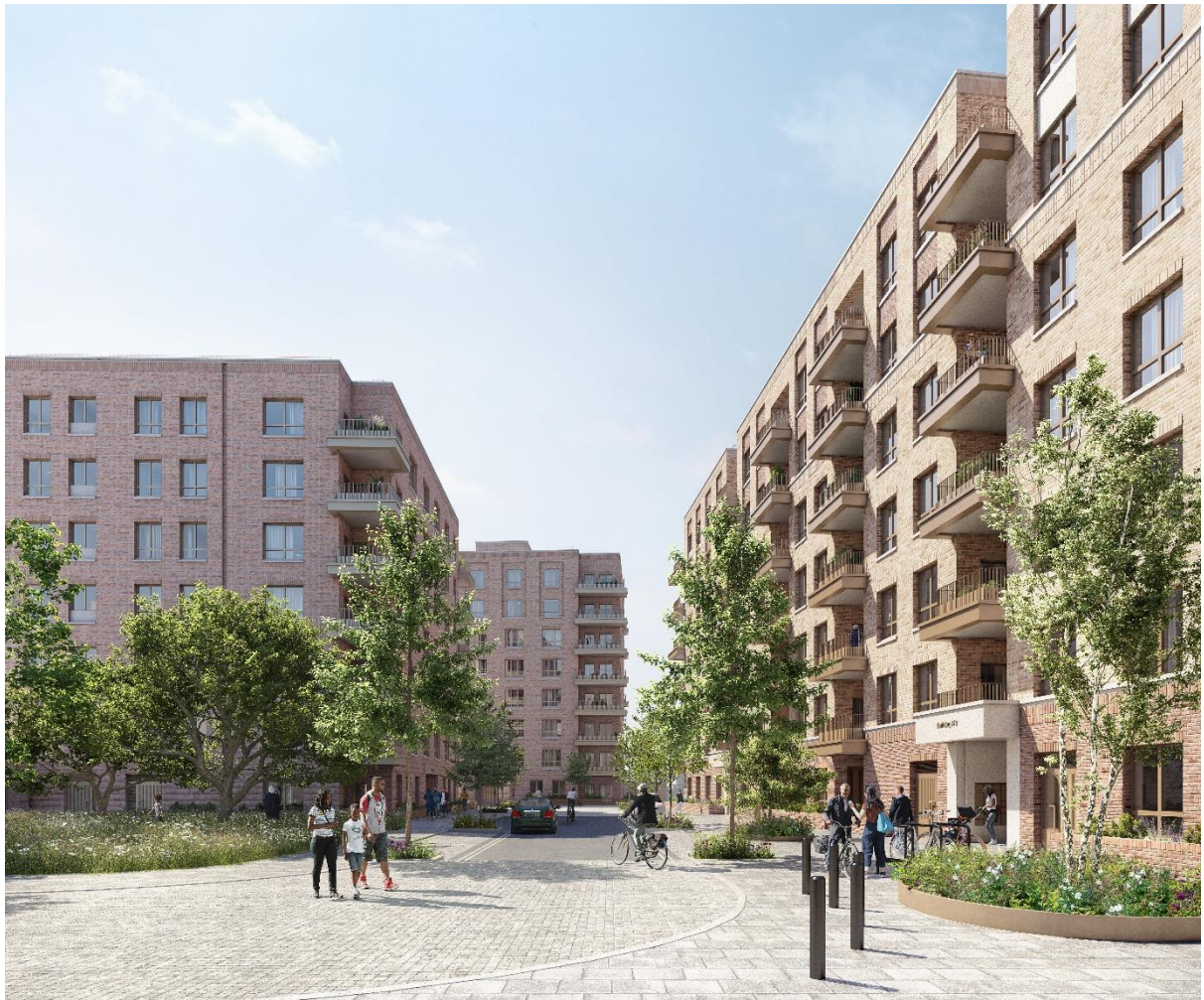
Ciew south between F and H blocks