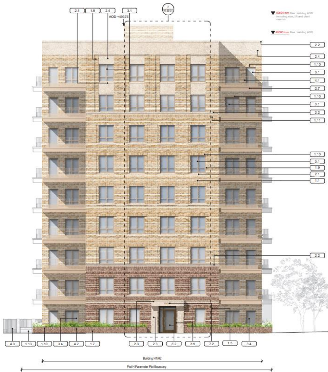
H1 and H2 elevation