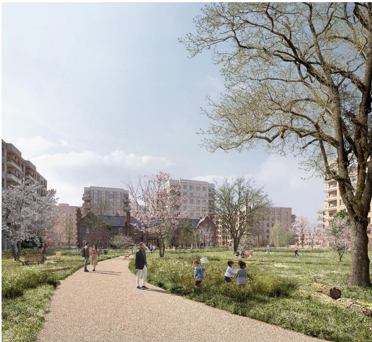
View south across Peace Garden to block F and H