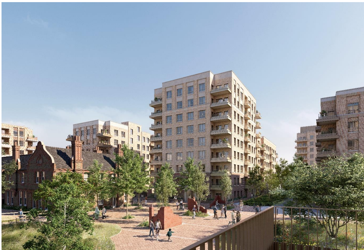
Blocks H and F looking south